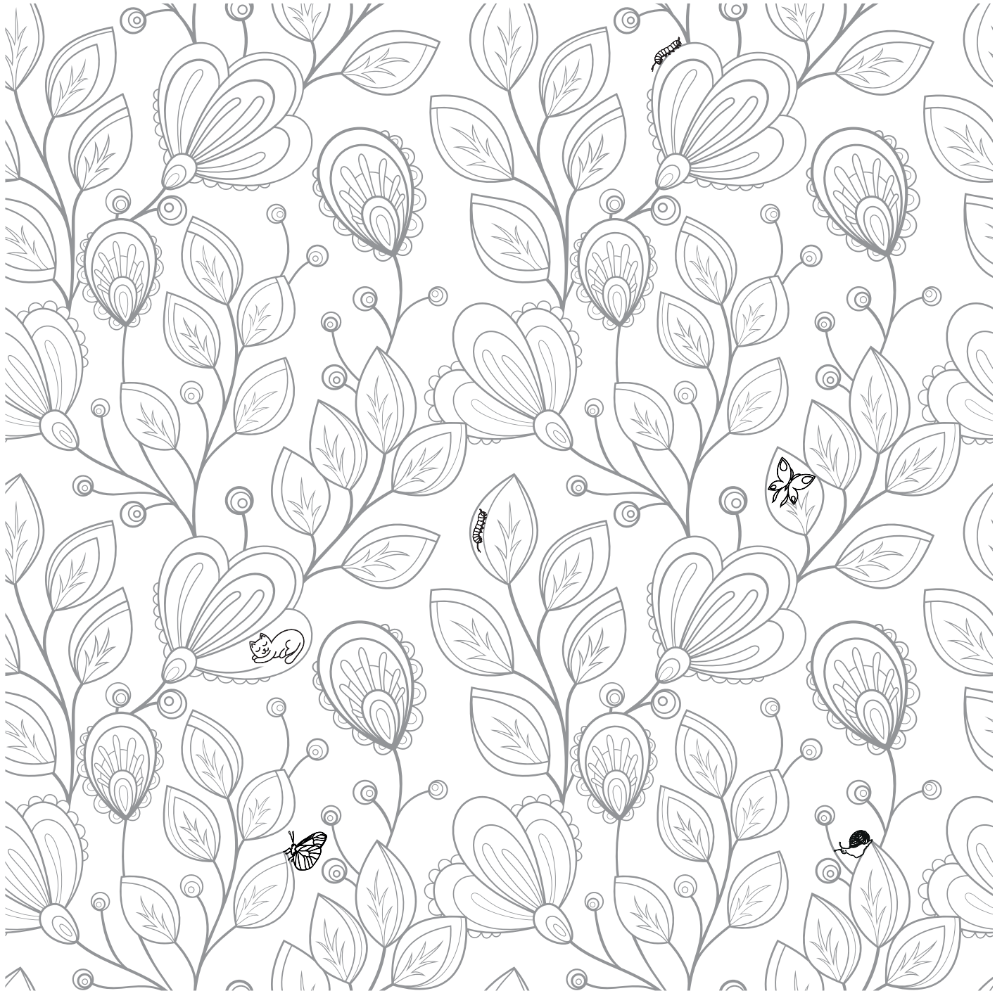
Solution: 1 Cat, 1 Snail, 2 Butterflies, 2 Caterpillars