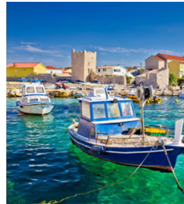
ITALY & CROATIA