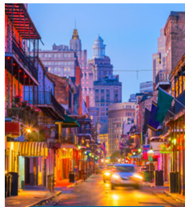
SOUTHERN USA & HAWAII

Not able to travel in 2018 or looking for inspiration for your next trip? Keep an eye out for these trips coming in 2019! Contact us at GrownUpsTours@globusfamily.co.nz to register your interest.