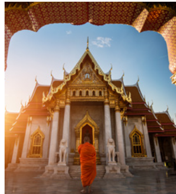
VIETNAM & CAMBODIA