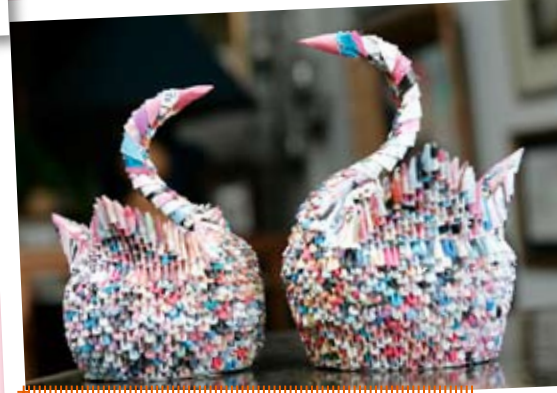
Somboon's Thailand-based sister Sudarat spends hours rolling, folding and linking New Zealand Woman's Weekly pages into beautiful origami-like swans