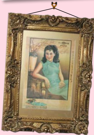
Above: David was thrilled to find this poster at a Chinese emporium in Auckland