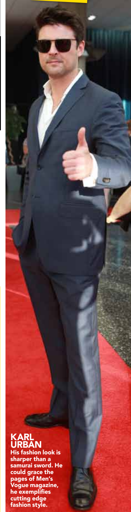
KARL URBAN His fashion look is sharper than a samurai sword. He could grace the pages of Men's Vogue magazine, he exemplifies cutting edge fashion style.