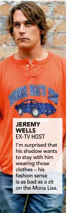
JEREMY WELLS EX-TV HOST

I'm surprised that his shadow wants to stay with him wearing those clothes – his fashion sense is as bad as a zit on the Mona Lisa.