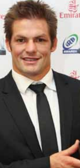
RICHE MCCAW ALL BLACKS CAPTAIN

He could be a clothes horse for any international fashion magazine spread. Casual or formally dressed, his fashion look is solid gold.