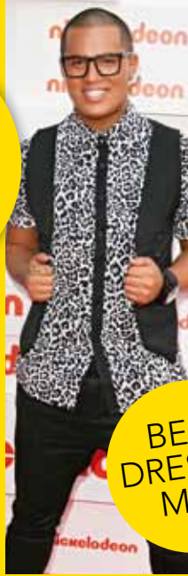
STAN WALKER SINGER

He gives you the feeling he's not interested in clothes, but his "whatever" fashion attitude looks good on him and he wears it well.