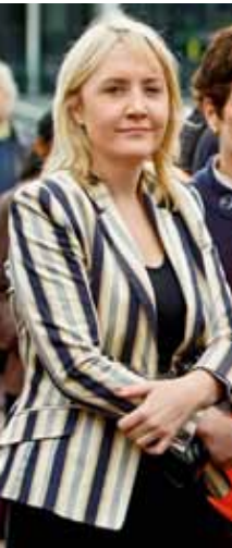
NIKKI KAYE POLITICIAN