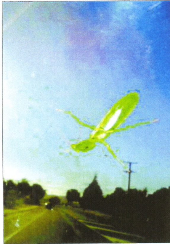
THE PHOTOGRAPHY BUG: Open category prize-winner Lorri Adams' photograph Windscreen .

GrownUps was founded in 2006 and is the only New Zealand website designed to meet the specific needs of New Zealanders aged 50 and over.